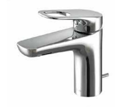
REI Lavatory Faucet